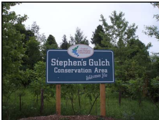
Stephen's Gulch welcome sign.

For more information please contact the Central Lake Ontario Conservation office at (905) 579-0411.