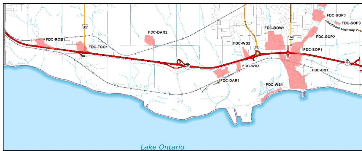
Figure 2: Municipality of Clarington Waterfront Areas and Flood Damage Centres