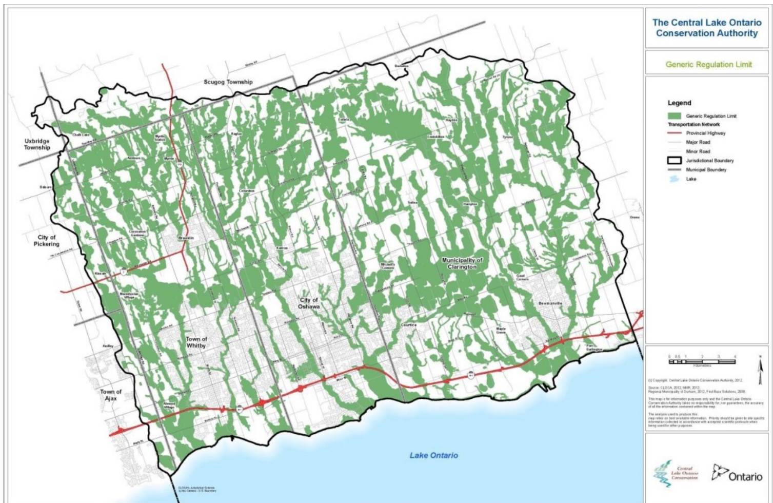
Figure 1 – Map of the Central Lake Ontario Conservation Watershed

Note: Lands outside of the watershed would be subject to the policy and procedural requirements of other Conservation Authorities.