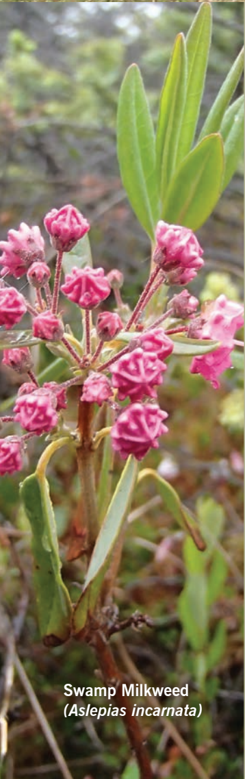
Swamp Milkweed (Asclepias incarnata)