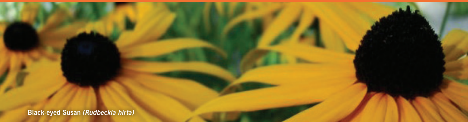
Black-eyed Susan ( Rudbeckia hirta )

These goals are described in more detail in the following pages. These are further defined by strategic actions that are required to achieve our vision, mission and goals.