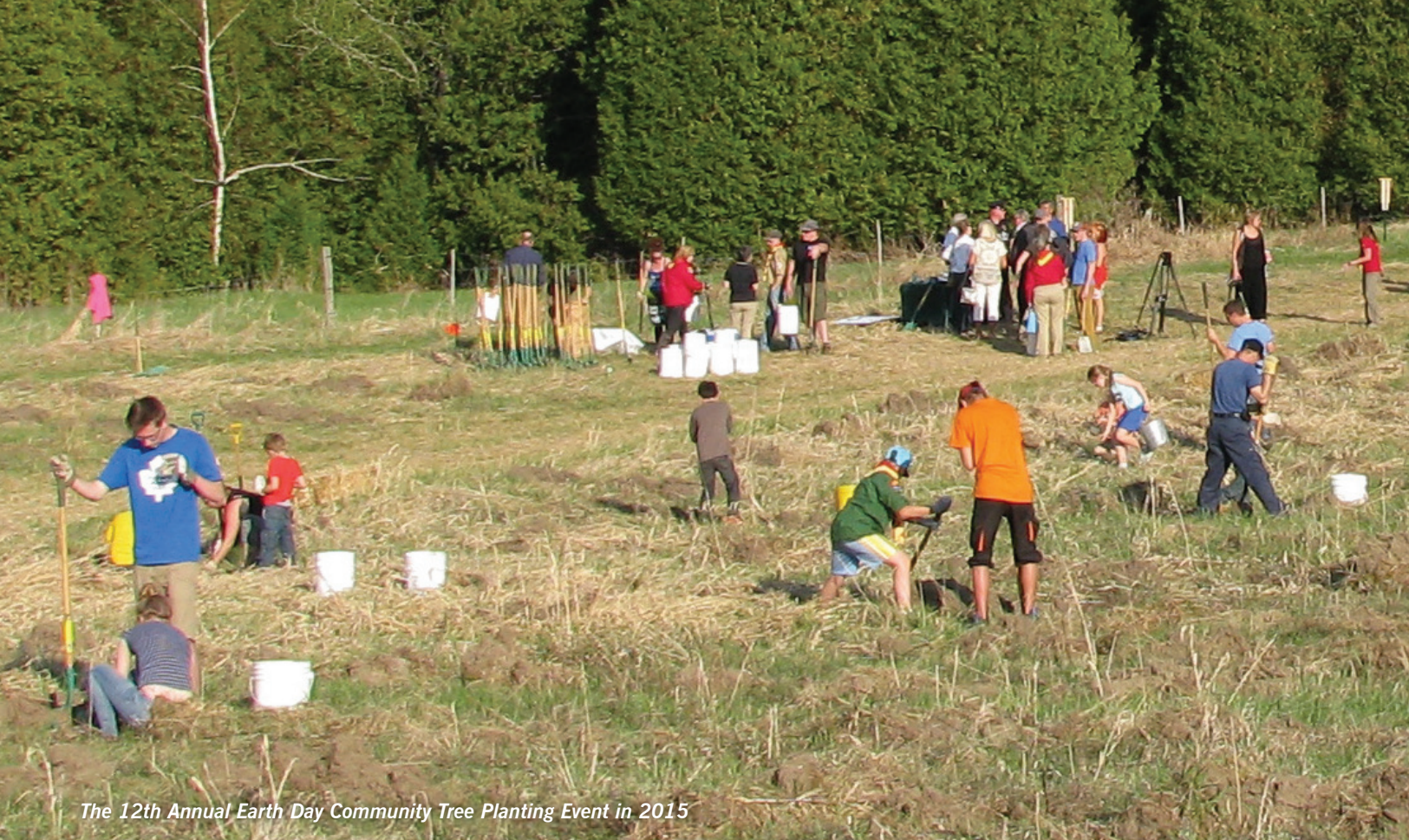
The 12th Annual Earth Day Community Tree Planting Event in 2015